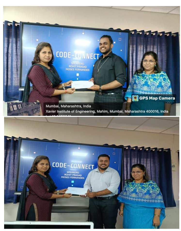
Honoring guest speakers with a Letter of Appreciation